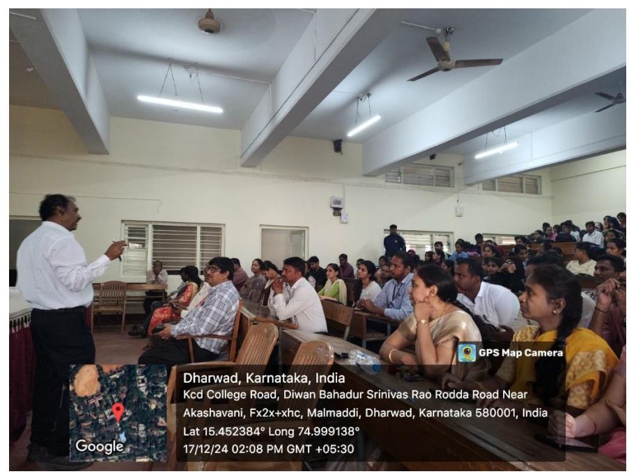
Figure 16. A photograph taken during the conduct of the workshop on Research Methodology, conducted on 17th December 2024