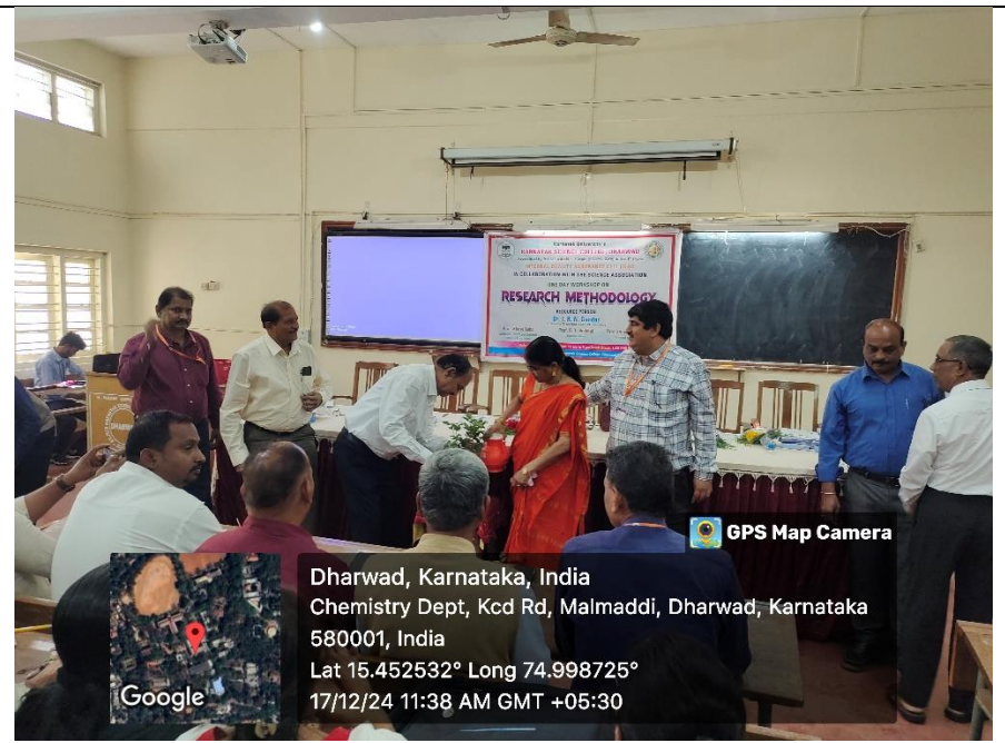
Figure 7. Earlier in the day, the workshop on Research Methodology was inaugurated by the dignitaries by watering a plant.